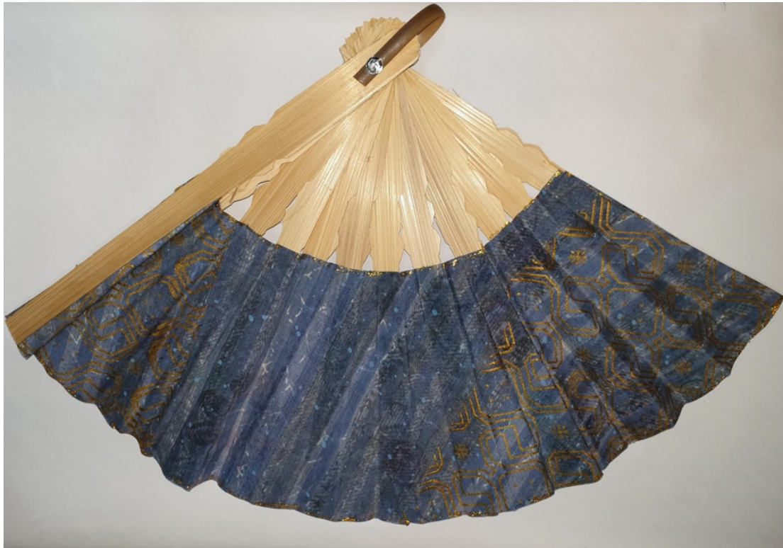
Figure 2. — After adequate Parametrium and Paracolpium regional resection, the entire uterine and cervical specimen with associated Parametrium and Paracolpium resemble a “Triangular Hand-Fan” structure.